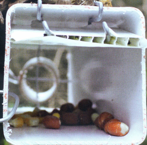
Hair tube baited with peanuts.