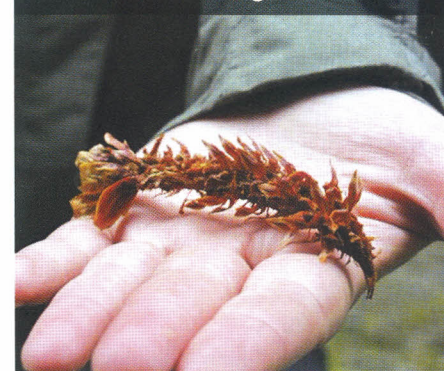
Pine cone stripped by red squirrel.

squirrels themselves can be difficult, and although it is possible, it takes luck and persistence to find them.